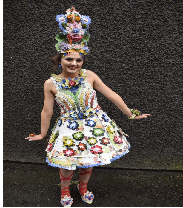
Once Upon a Time